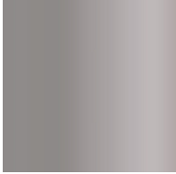
Matte White Lacquer - MWL